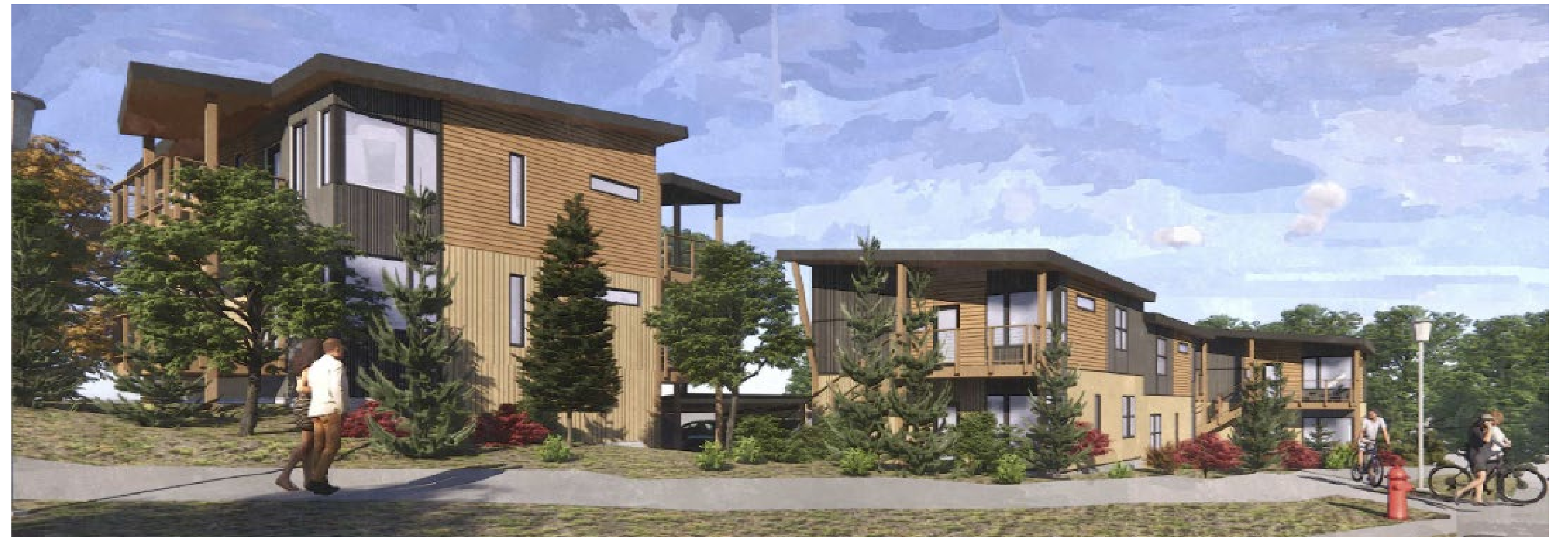
8th Street Community in Glenwood Springs, Colorado. Image credit: KEO studioworks